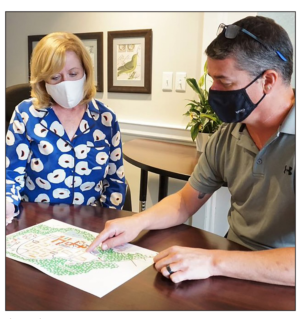
Planning the WiFi Project.